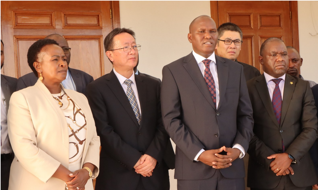
A delegation from KEWI and Gansu Provincial Department of Water Resources when they met Machakos County Governor Hon. Wavinya Ndeti. The delegation visited the proposed site for the International Research and Training Centre on Rainwater Harvesting and Irrigation in the County.