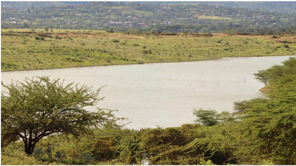
A dam in Machakos County. Rainwater harvesting for irrigation and especially in water scarce counties will receive a major boost once the center for water harvesting and irrigation comes up in Machakos County.

( W R A ) , nearly 80% of Kenya's landmass is classified as arid or semi-arid, making water availability one of the most urgent development concerns. The new Centre is expected to provide