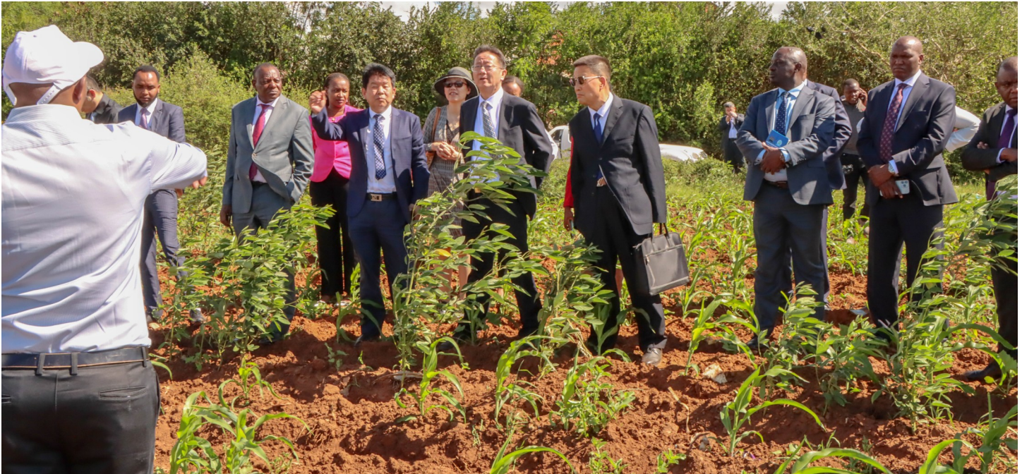
A delegation from KEWI and Gansu Provincial Department of Water Resources when it visited the proposed site for the proposed International Research and Training Centre on Rainwater Harvesting and Irrigation in Machakos County.

on China-Africa Cooperation action plans. He noted the significance of rainwater as a non-conventional resource critical for food security, particularly in the face of global climate challenges.