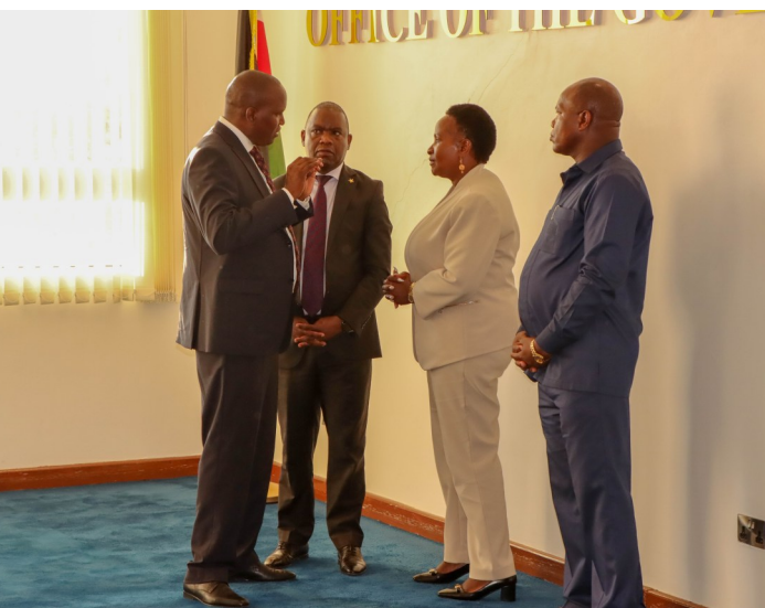
Moments during the China Delegation and KEWI meeting at KEWI Headquarters and the Courtesy Visit to Machakos County Governor Hon. Wavinya Ndeti.