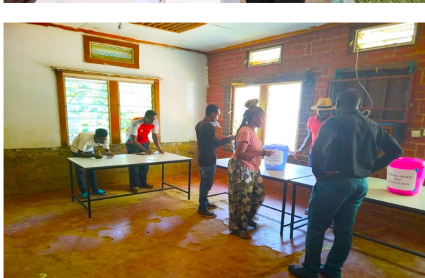
Moments during the election exercise for various leadership position for KEWI Students Council.