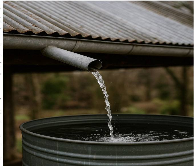
Water harvested through a gutter collects into a storage facility. According to Kenya National Bureau of Statistics (KNBS) 2019 Report, only 3.9% of households use rainwater as a primary drinking source, despite 80.3% of dwellings having iron sheet roofs suitable for rainwater harvesting.

Over two-thirds of Kenya receives less than 500 mm of rainfall annually, while only 11% receives more than 1,000 mm (NWHSS, 2020–2025). The National Water Harvesting and Storage Strategy targets increasing national water storage from 124 million cubic