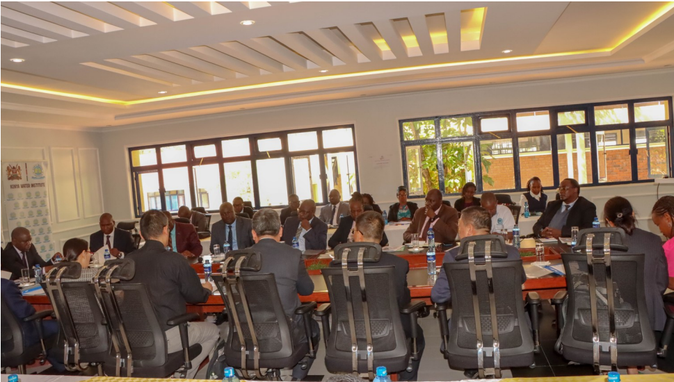
A seminar on Rainwater Utilization and Dryland Farming Technology Exchange held at KEWI Headquarters that brought together KEWI management, Chinese delegation, KEWI departmental heads, and water sector players to discuss on areas of possible collaboration on rainwater harvesting and irrigation techniques.

underscored the urgent need to prioritize training, research, and innovation in the water sector.