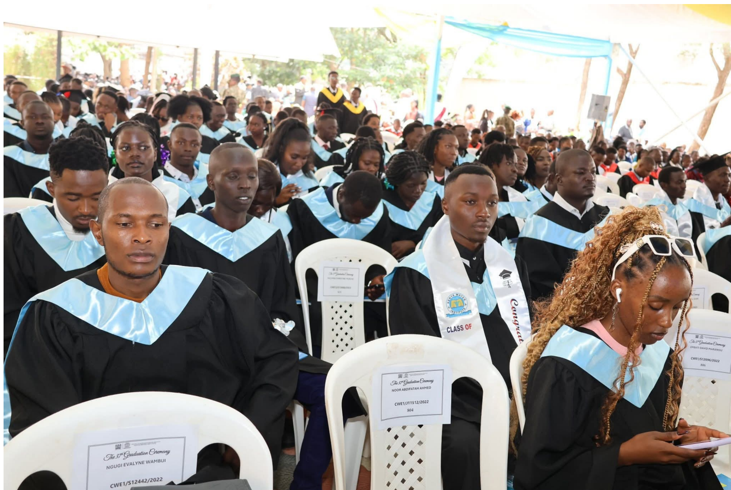
Graduands during the 37th graduation Ceremony.

The State Department, with support from development partners, has made significant investments in infrastructural and human capacity development in the organizational review towards transforming KEWI into a Technical Centre of Excellence in training and research as envisaged in the National Water Policy. Such partners include AfDB and DANIDA supporting sanitation initiatives, Nuffic in the area of water smart agriculture, and JICA which partners with us in Non-Revenue Water Management. I also take